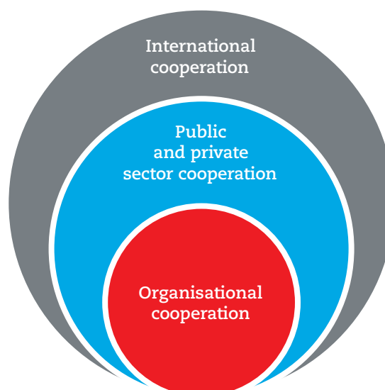
FIGURE 3.2: Scale of cooperation required for effective information sharing