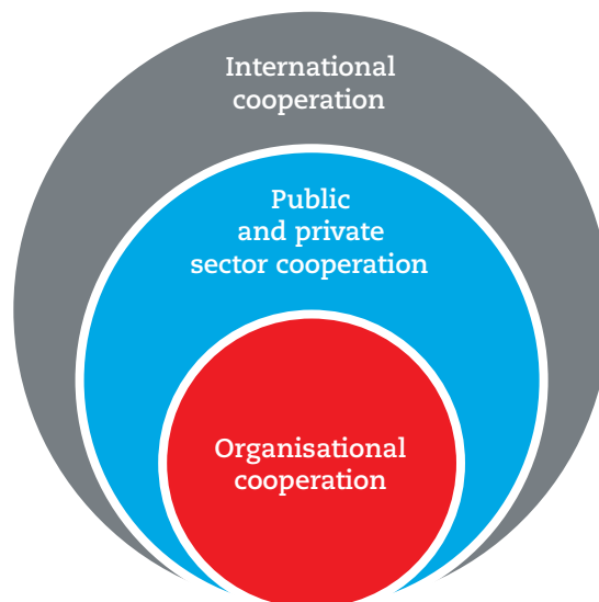
FIGURE 3.2: Scale of cooperation required for effective information sharing