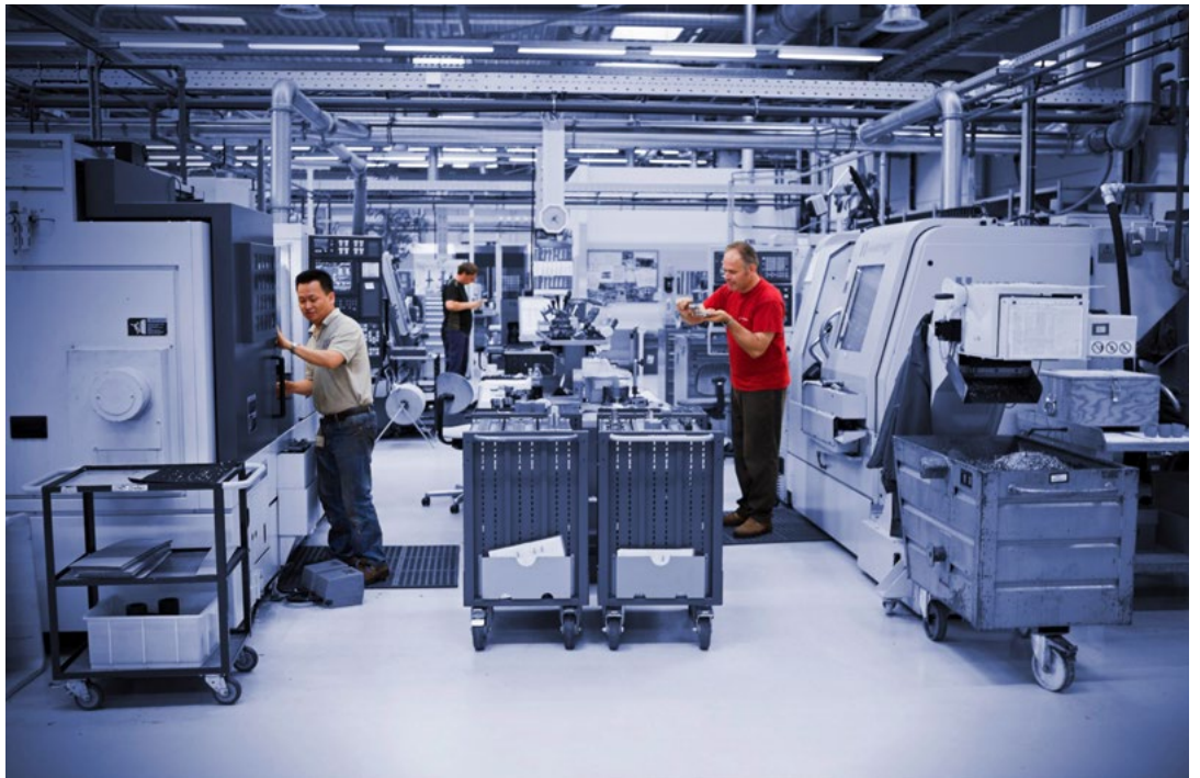
The state-of-the-art manufacturing facility develops, produces and distributes highly accurate laboratory instruments.