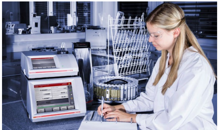
Anton Paar GmbH is the world leader in the measurement of density, concentration and carbon dioxide.