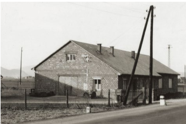
The original building for the Graz headquarters, which was located in Kaerntnerstrasse.

Succession to the fourth generation was also through the son-in-law route. Such a process, especially if it happens twice in one company, is unusual for family businesses in the West. But son-in-law succession is much more common in Japan,