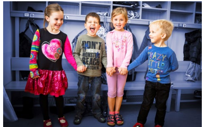
Anton Paar has an employee kindergarten connected to the company’s headquarters; four members of the sixth generation are already linked to the business by attending the kindergarten.

Anton Paar is an exemplary case of a family business that has prospered not just through its efforts to stay ahead of the technology curve but also because of its progressive family and company governance structures. These factors have created a legacy that will long be a defining aspect of Anton Paar, as the fifth and sixth generations take on more responsibility and the business continues to prosper in the years ahead.