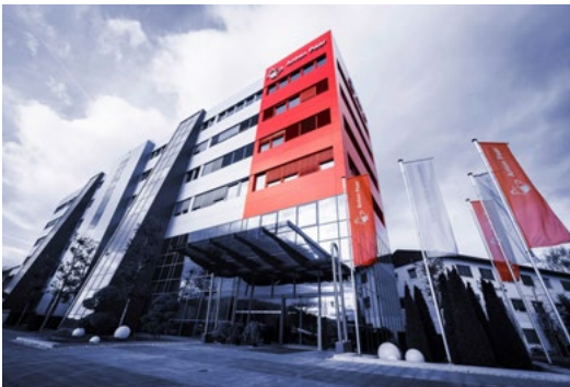
Today, the headquarters in Graz, Austria, employs more than 2,200 people and has more than 25 sales subsidiaries worldwide.