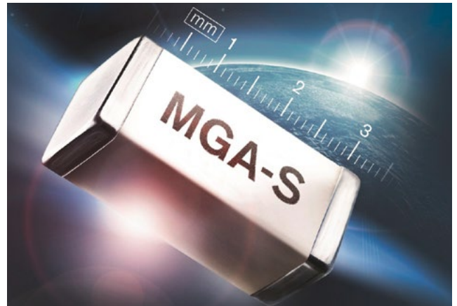
The Space Fuse: SCHURTER is the only supplier ever to have a MGA-S fuse component included in the European Space Agency’s Qualified Parts List (QPL).