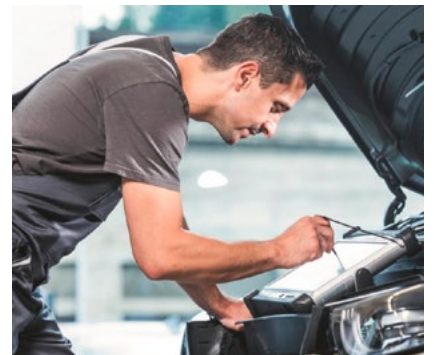
The rising demand for hybrid and electric vehicles is a stimulant for the automotive industry.