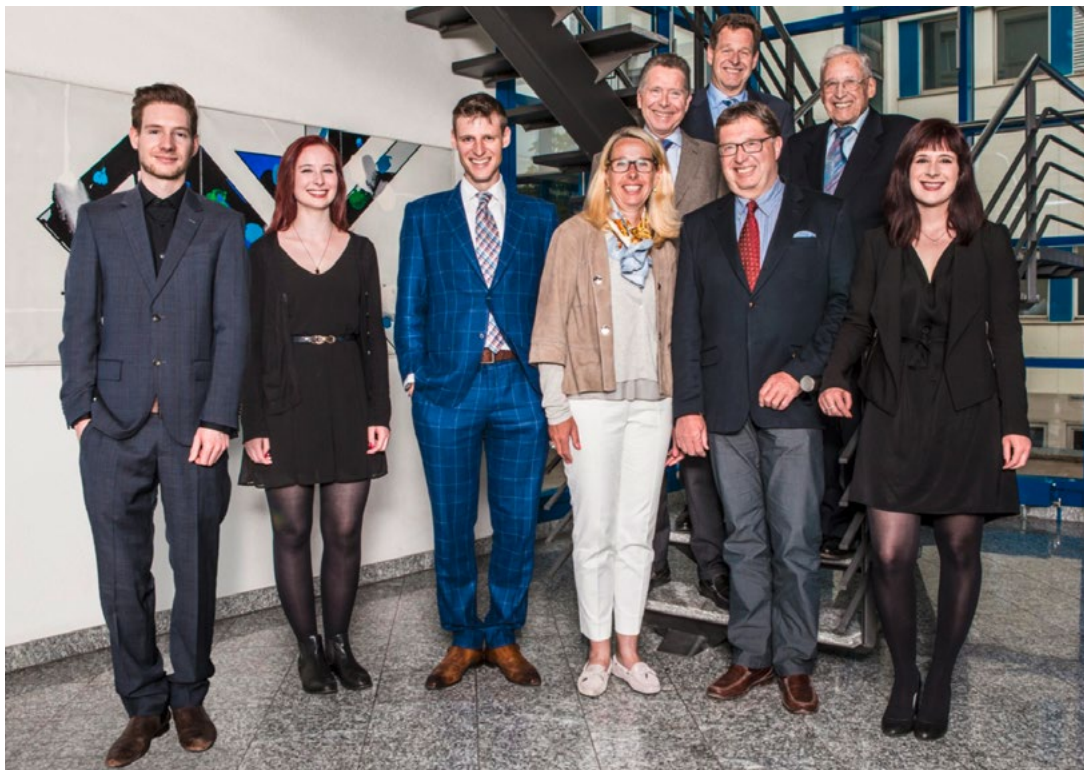
The shareholders of the SCHURTER Group comprise three generations (April 2015).