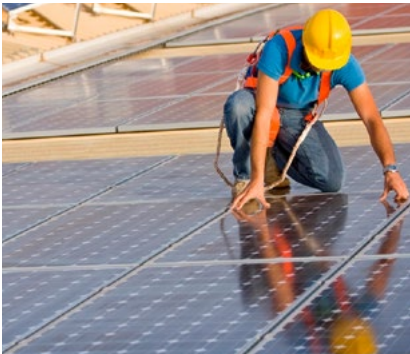
Uninterrupted electricity supply represents a key competence in the 21st century.