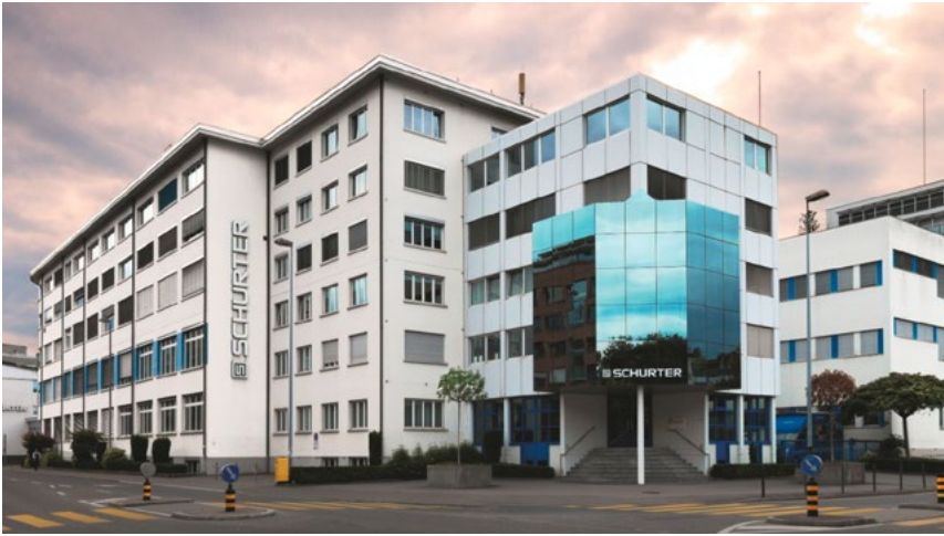
SCHURTER Electronic Components is a leading innovator and producer of electronic components.