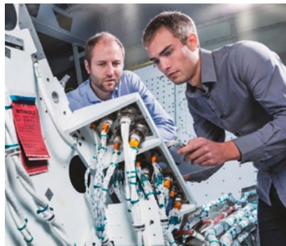
Absolute reliability under extreme conditions is essential in aviation and space technology on aircraft, satellites and spacecraft.