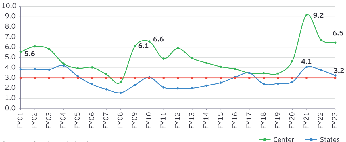
Chart 1: Fiscal deficit relative to GDP: union government and states